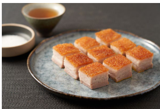
Crispy Roasted Suckling Pig