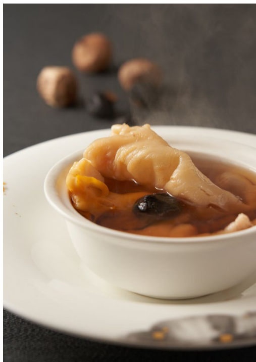
Double-Boiled Fish Maw Soup with Sea Whelk and Black Garlic