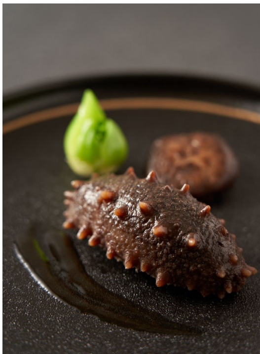
Braised Kanto Sea Cucumber with Scallion in Supreme Oyster Sauce