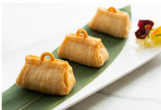
Angus Beef Puff