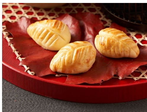
Crispy Citrus Puff