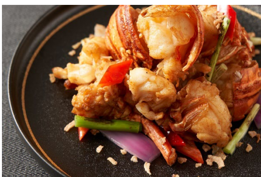
Wok-fried Lobsters with Purple Onion, Spring Onion and Shallot